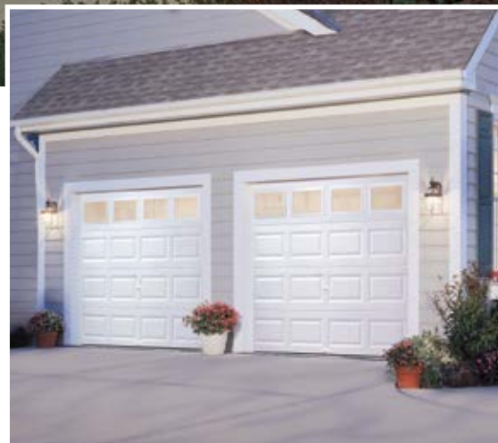
Model T42S, Short Traditional Panel with Plain Short Windows